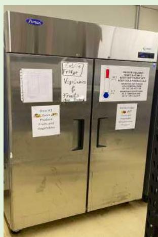
St. Brigid's new double-door refrigerator that holds fresh fruit and vegetables.

In 2013, in the wake of Super Storm Sandy, Fulfill launched a grantmaking program to help our network of food pantries, soup kitchens, and community distribution sites rebuild. Today, that program has become an important resource to support our network's ability to sustain, grow, and improve services for our neighbors facing hunger – especially since many of our partners are completely volunteer-run and don't have annual budgets or fundraising staff. Governed by our Agency Partner Advisory Committee, we awarded $176,769.71 in funds in 2023 to 44 pantries and soup kitchens that needed new freezers, refrigerators, shelves, conveyor belts, ramps, and more.