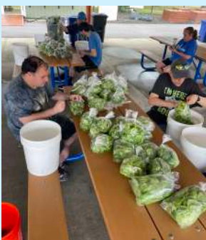
Freshly picked lettuce being bagged by Field of Dreams participants to come back to Fulfill.

Our on-site quarter-acre organic garden harvests 6,000 pounds of produce annually, including fruits, vegetables, and herbs. It is distributed through our nearly 300 partner sites, mobile pantries, two culinary kitchens, and at our Pop the Trunk Distributions.